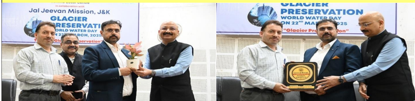
A mark of Souvenir being presented to the Mr. Satish Sharma, the Hon'ble Minister