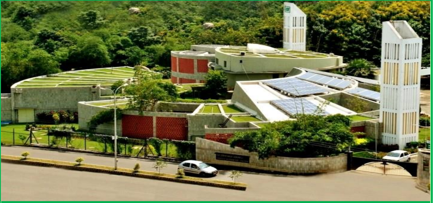
CII-Sohrabji Godrej Green Building, Hyderabad. Inaugurated by His Excellency Late Dr. A. P. J. Abdul Kalam, the then President of India on 14 July 2004, the Building was First Green Building to receive LEED Platinum accreditation outside US.

Green Buildings are the structures designed to minimize their environmental impact while promoting sustainability, energy efficiency, and occupant well-being. They incorporate eco-friendly practices and materials throughout their construction, operation, and maintenance phases. The primary goal is to reduce the consumption of natural resources and enhance the overall quality of life for users.