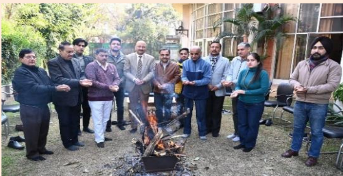
Members around the holy bonfire of Lohri

The Institution of Engineers (India), Jammu Local Centre, celebrated the vibrant festival of Lohri with great zeal and enthusiasm at Institutional Complex, Sector-3, Channi Himmat, Jammu on 13 th January, 2025. The event witnessed active participation from Members, making it a memorable occasion.