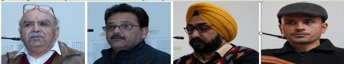
Engineers presenting their papers on World Engineering Day for Sustainable Development